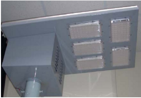
Solar Road Lamp Panel Type 5 ES-300LSL-01

LED 300 Inside Circle 20000mcd Outside Circle 12500mcd Color White, Yellow Lumen Output 1100lumin / 15.5lux Size 1054mm x 567mm x 755mm 62kg Solar Panel 17.4V / 80W / 100W Battery Lead Acid 12V / 85 AH