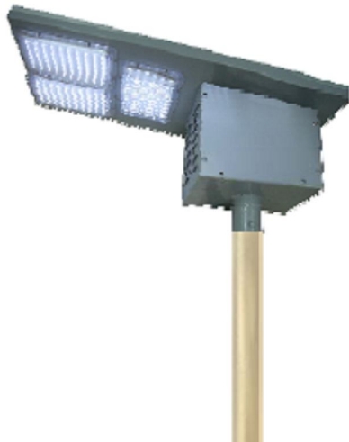
Solar Road Lamp Panel Type 3 ES-180SL-01

LED 60 Inside Circle 20000mcd Outside Circle 12500mcd Color White, Yellow Lumen Output 220 lumin / 3.1lux Size 660mm x 370mm x 350mm 14kg Solar Panel 17.4V / 14W / 20W Battery Lead Acid 12V / 12 AH