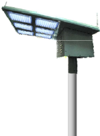
Solar Road Lamp Panel Type 6 ES-360LSL-01

LED 300 Inside Circle 20000mcd Outside Circle 12500mcd Color White, Yellow Lumen Output 1100lumin / 15.5lux Size 1054mm x 567mm x 755mm 62kg Solar Panel 17.4V / 80W / 100W Battery Lead Acid 12V / 85 AH