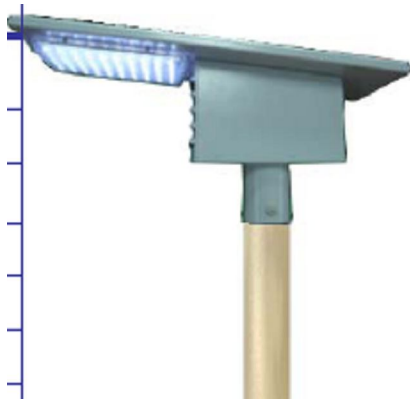
Solar Road Lamp Panel Type 1 ES-60SL-01

LED 60 Inside Circle 20000mcd Outside Circle 12500mcd Color White, Yellow Lumen Output 220 lumin / 3.1lux Size 660mm x 370mm x 350mm 14kg Solar Panel 17.4V / 14W / 20W Battery Lead Acid 12V / 12 AH